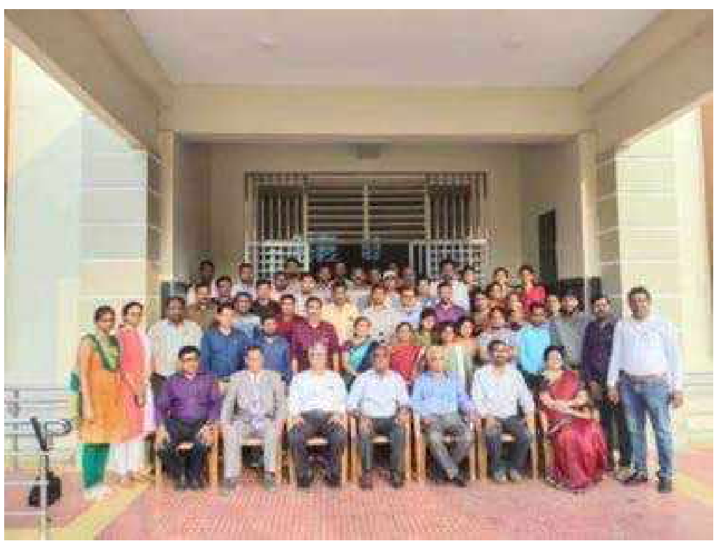
PENDRANI MAHAVIDYALAYA, UMERKOTE