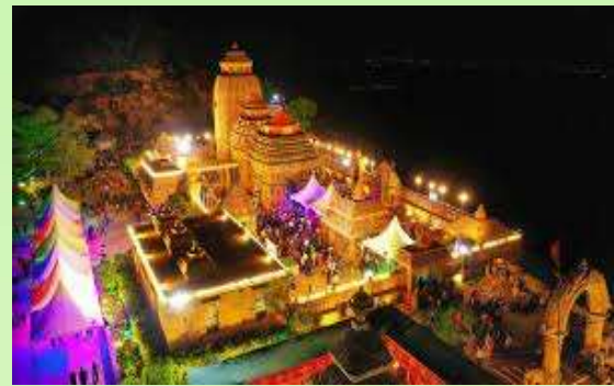
Tara Tarini Temple, Ganjam