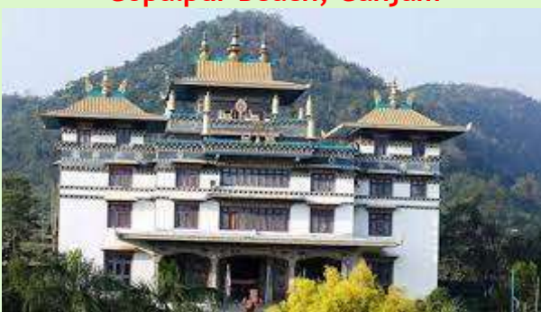
Jirang Monastery, Gajapati