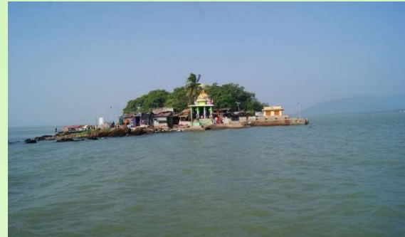
Chilika Lake, Ganjam