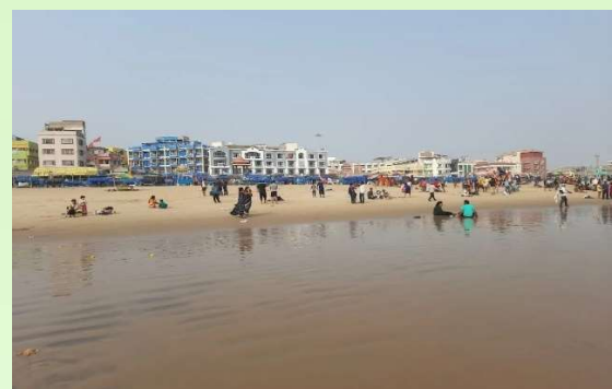
Puri Beach, Puri