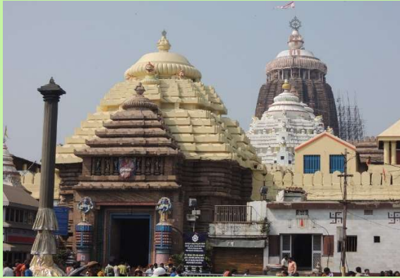
Lord Jagannath Temple Puri