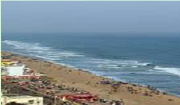
Gopalpur Beach, Ganjam