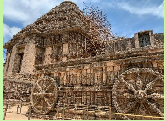
Sun Temple Konark, Puri