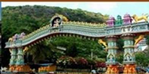
SIDDHA BHAIRAVI TEMPLE