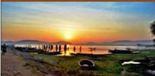
RAMBHA, CHILIKA LAKE