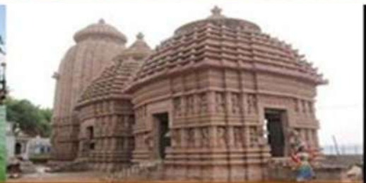
TARA TARENI TEMPLE