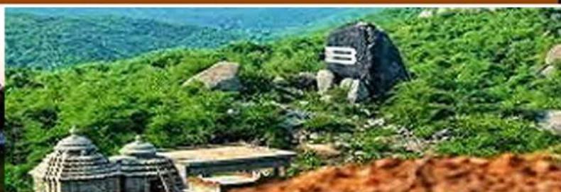
MAA BALAKUMARI TEMPLE