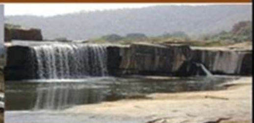
TAPTAPANI HOT WATER SPRINGS