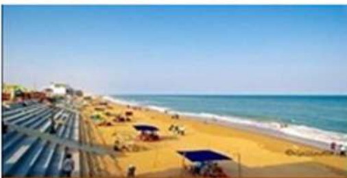
GOPALPUR SEA BEACH

Gopalpur Sea Beach, Chilika Lake, Kalijai Temple, Tara Tarini Temple, Bhairabi Temple, Tampara Lake, Nirmal Jhar, Taptapani-A Hot Water Spring, and many more.