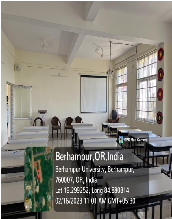
LECTURE HALL I