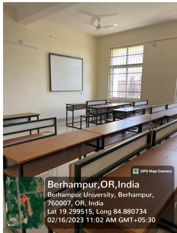
LECTURE HALL IV