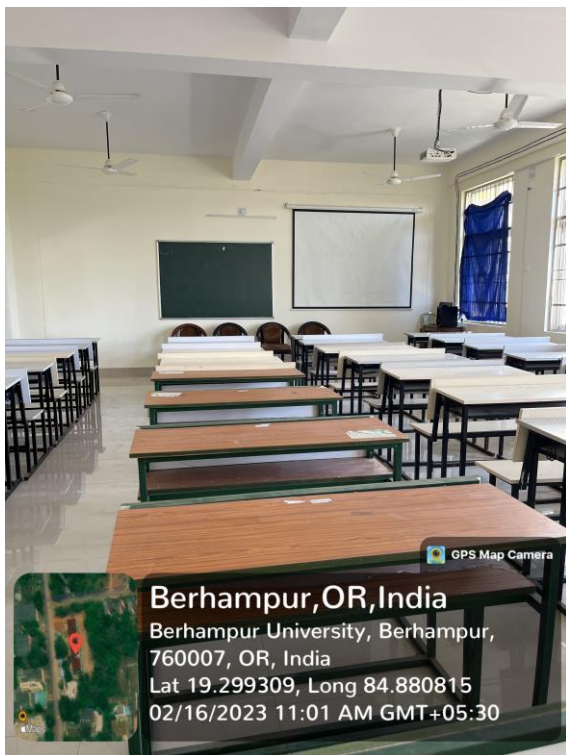
LECTURE HALL III