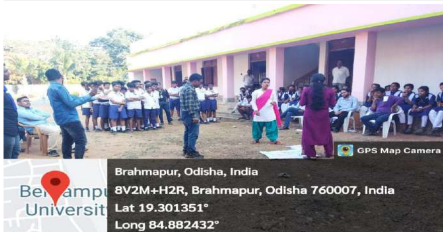
Gender Sensitization Programme organized by the NSS Bureau in one of the adopted villages near the University Date: 08 th September 2021