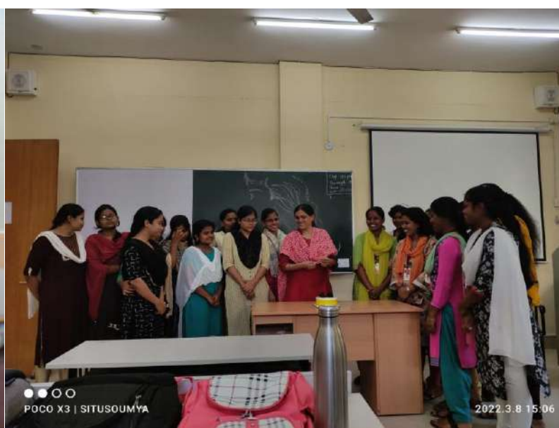
Gender Sensitization Programme arranged in the Dept. of IRPM Date: 8 th March, 2022 (Intentional Women's Day)