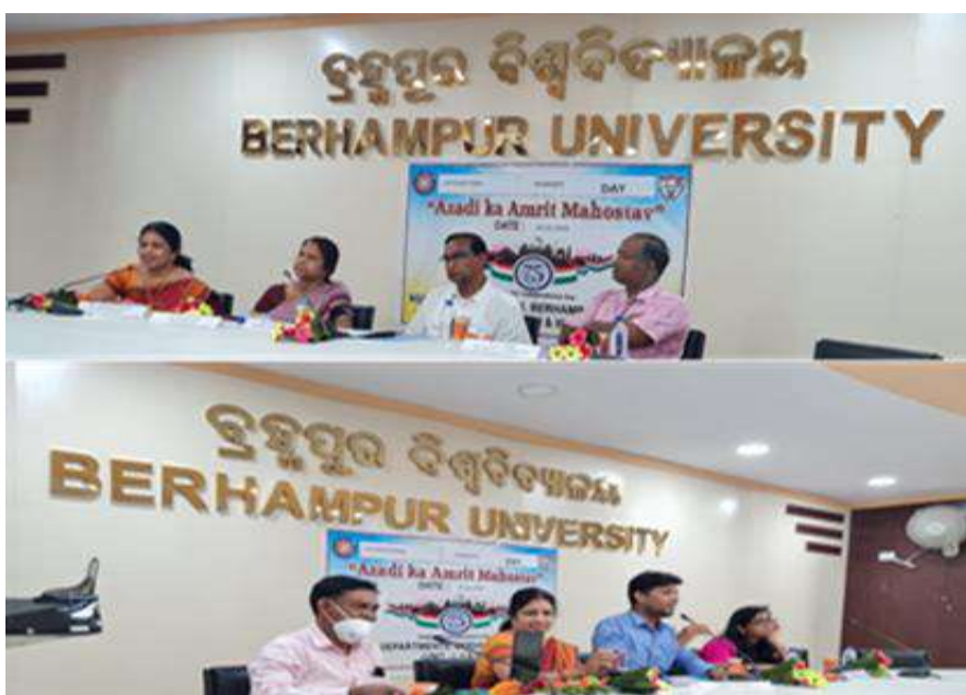
Gender Sensitization Programme Date: 8 th March, 2022 (Intentional Women's Day) Theme: Gender Equality Today for a Sustainable Tomorrow