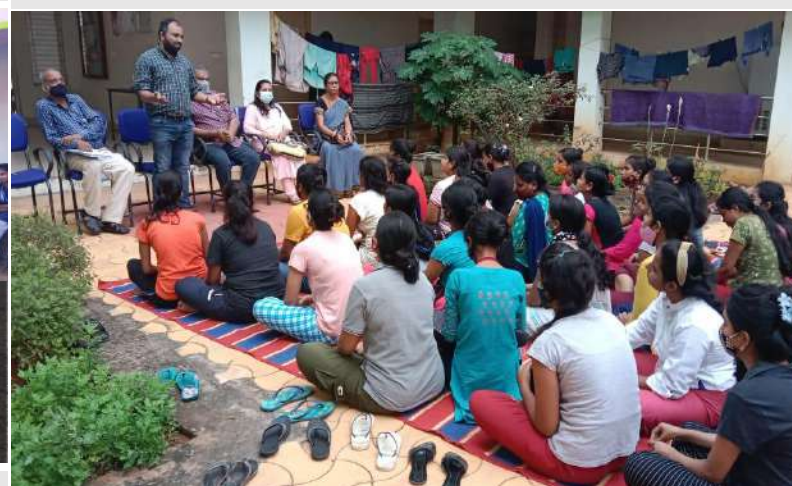
Gender Sensitization Programme organized in Ladies Hostel Complex Date: 8 th March, 2022 (Intentional Women's Day)