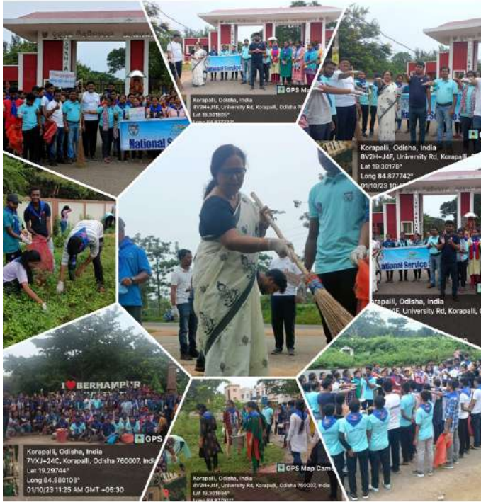
NSS PG Unit Embarks on "One Hour, One Family, One Earth" Cleaning Drive