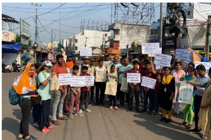
Cloth bag distribution in City