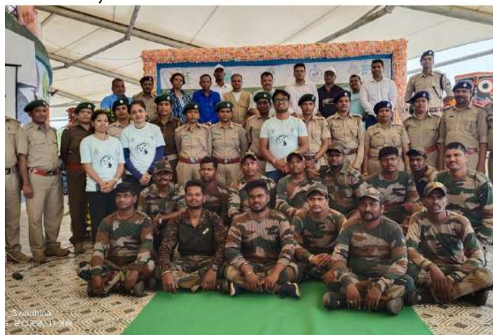
WED Celebration at Tampara Lake