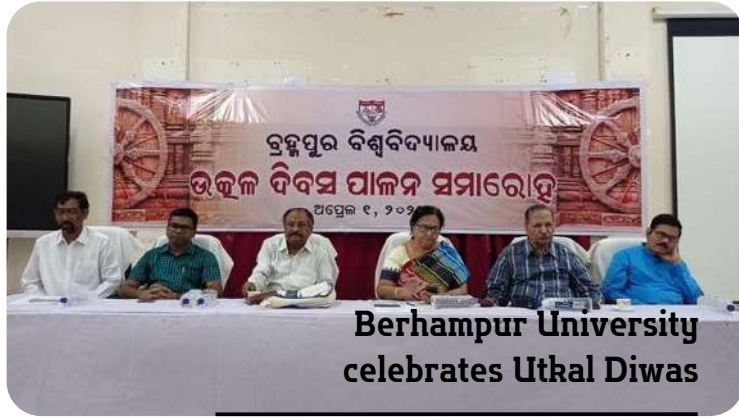
Berhampur University celebrates Utkal Diwas