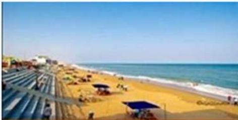
GOPALPUR SEA BEACH

Gopalpur Sea Beach, Chilika Lake, Kalijai Temple, Tara Tarini Temple, Bhairabi Temple, Tampara Lake, Nirmal Jhar, Taptapani- A Hot Water Spring, and many more.