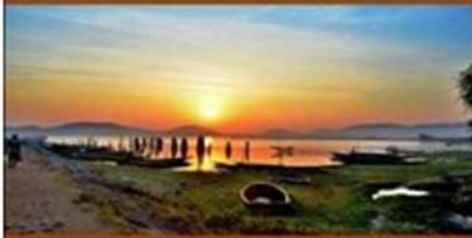
RAMBHA , CHILIKA LAKE