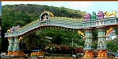
SIDDHA BHAIRAVI TEMPLE