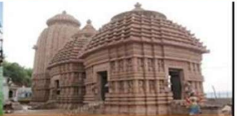
TARA TARENI TEMPLE