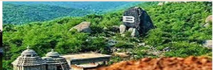
MAA BALAKUMARI TEMPLE