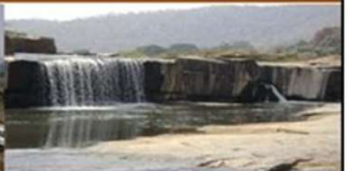
TAPTAPANI HOT WATER SPRINGS