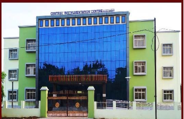
BERHAMPUR UNIVERSITY, BHANJA BIHAR, BERHAMPUR-760007 (ODISHA)